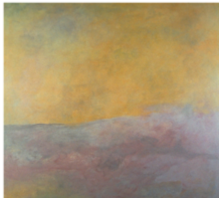
Sun Leaving, III (o/c 101), Romasaig 1971, 69"x76"