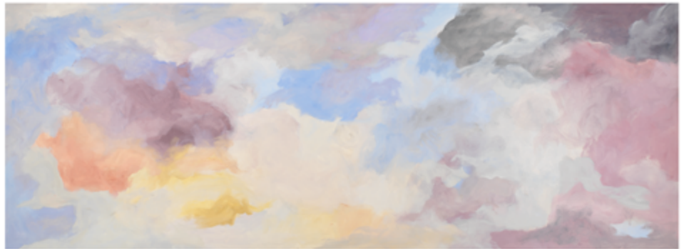
Changes: Red, Blues and Light (o/c 1239), New York 1982, 79"x216"

Jon Schueler The Lobby Gallery 499 Park Avenue at 59th Street New York, NY 10022 Sponsored by Hines July 9, 2012 to January 4, 2013