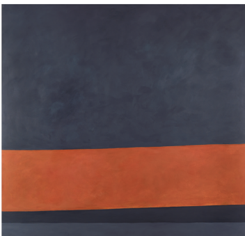
The Sound of Sleat: Red in a Summer Night, IX, o/c 13; Resipole Studios

To commemorate the special Schueler Centenary year, the Jon Schueler Estate has printed 6 greeting cards and 7 postcards, which can be purchased wholesale by museum gift shops, and retail from the web site. Exciting to see the orders coming in.