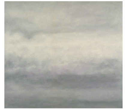
A Walk on Sunday, o/c 562; Berkeley Art Museum