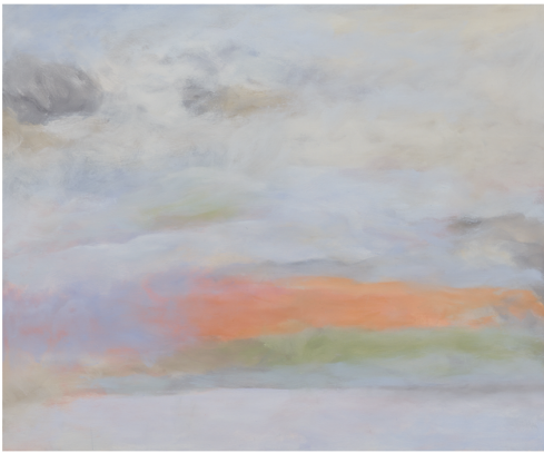
North to Ornsay, o/c 994; Univ. of Wyoming

The Joan Mitchell Foundation has generously donated one of the two small paintings, bought from Jon Schueler in 1971, to the Albright- Knox Art Gallery in Buffalo, NY. 49 museums in the US and UK (and one in Australia) now own Schuelers.